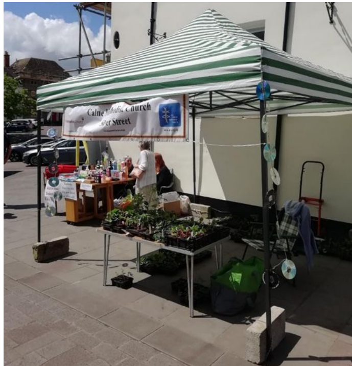
Stall at last year's Carnival

Items for future editions can be sent to: