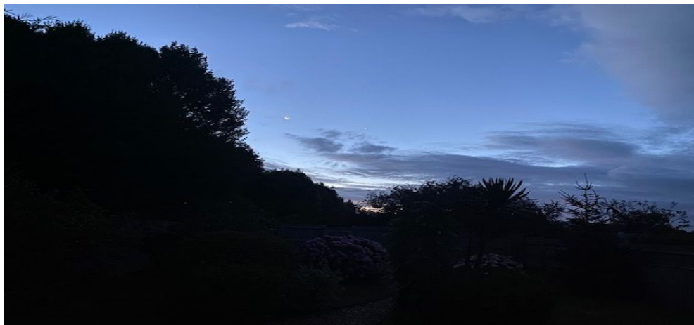
Preston Weymouth July 2025 (0400 approx.)

Sir John Lubbock, (scientist), once observed, “Rest is not idleness, and to lie sometimes on the grass under trees on a summer's day, listening to the murmur of the water, or watching the clouds float across the sky, is by no means a waste of time.”